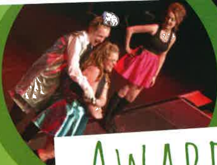
Returning to the Forbidden Planet