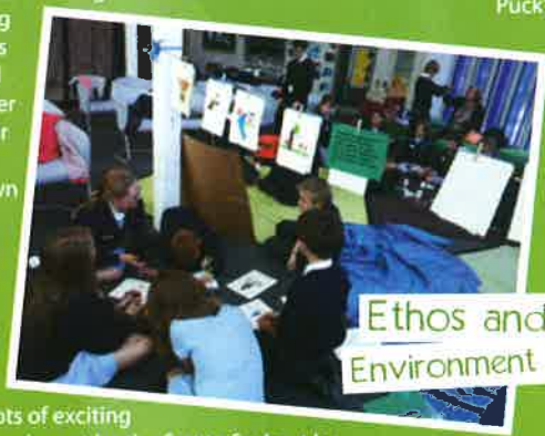
Ethos and Environment Day