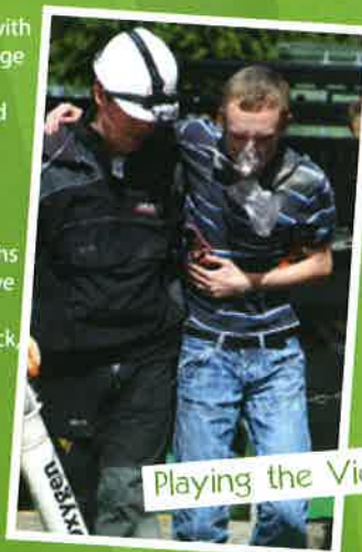
Playing the Victim