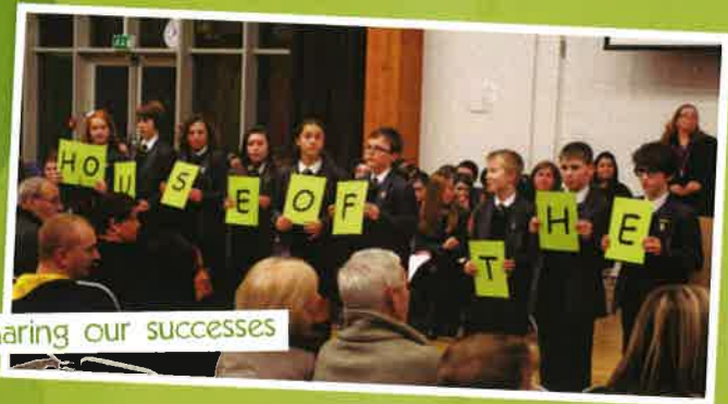
Sharing our successes