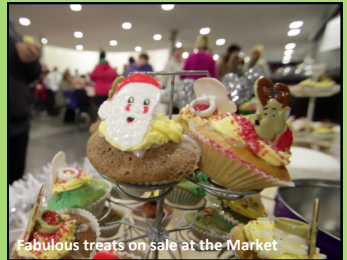
Fabulous treats on sale at the Market

The Christmas Market was a huge success with stalls run by the local community. One parent said ‘The Christmas Market has been brilliant. We look forward to coming next year.’