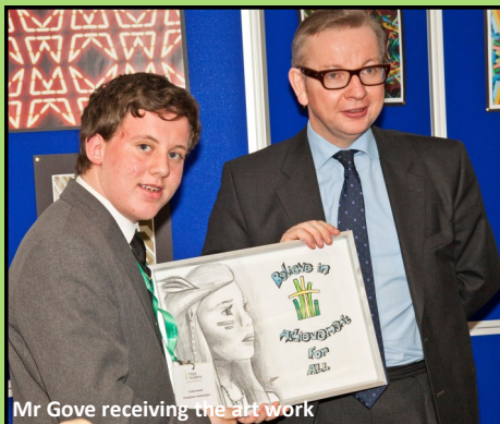
Mr Gove receiving the art work

Michael Gove said: “I was very pleased to see the ‘Achievement for All’ programme beginning to have a real impact at Hope Academy, after just five months. The programme is already helping to track children’s progress and encouraging more structured conversations between teachers and parents. It is crucial that children’s needs are picked up early and the right support is available. The ‘Achievement for All’ programme has a proven record for improving progress, results and outcomes for children. I welcome the fact that together Hope Academy and ‘Achievement for All’ are supporting children in this way.”